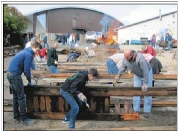
About 60 volunteers that showed up to help clean the old warehouse at Raptor Creek Farm Saturday.